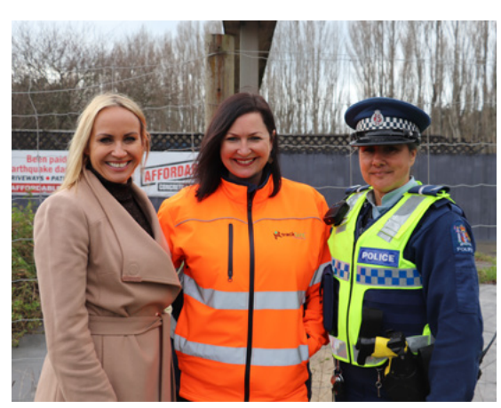
Filming story for TVNZ's 'One News'.